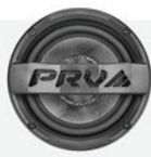
6MR500CF-NDY-4 HIGH-PERFORMANCE MIDRANGE PRO AUDIO SPEAKER