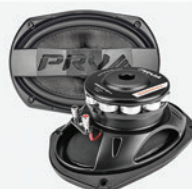
69MR500CF-NDY-4 HIGH-PERFORMANCE SOLUTION FOR CAR AUDIO STEREO