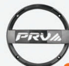
6GRILL-POLY 6.5" SPEAKER GRILL SCREWS INCLUDED