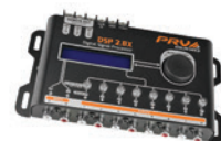
DSP 2.8X 8 OUTPUT CHANNELS