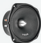
69MR500-4 BULLET HIGH-PERFORMANCE SOLUTION FOR CAR AUDIO STEREO