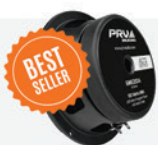
6MR200A BEST-SELLER MIDRANGE PRO AUDIO SPEAKER