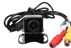
Image Sensor: CMOS, OV 7955, Power: 12V DC, Negative Ground, Power Consumption: <1 Watt, Effective Pixels: 672H x 492V, Video Format: NTSC, Lux: <0.5, White Balance: Auto, Viewing Angle: 170 Degrees, IP Rating: IP67, Operating Temperature: -30C ~ +70C, Plate material: Stainless Steel SUS304, Camera Body: Plastic