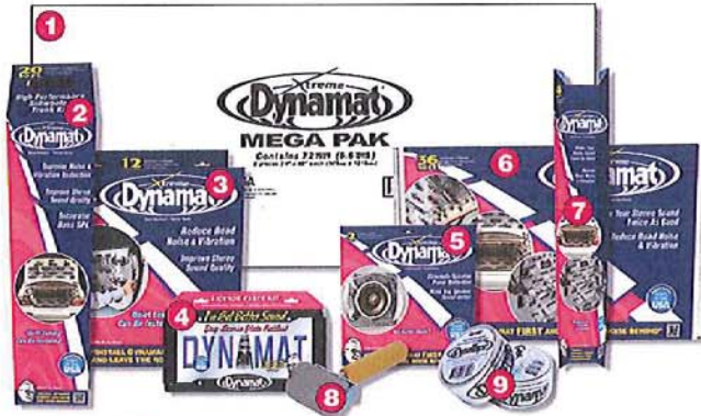
Dynamat Xtreme: (1) Mega Pak (2) Trunk Kit (3) Door Kit (4) License Plate Kit (5) Speaker Kit (6) Bulk Pak (7) Hex Pak (8) Rubber Application Roller (9) DynaTape