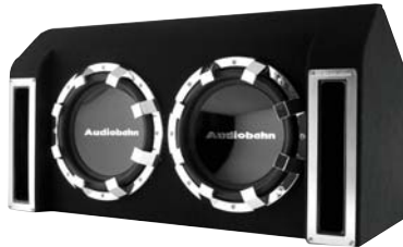
ABB102J – Dual 10" Slot Ported Enclosure - 600 Watts RMS/4 ohm Stereo - 45 oz. Strontium Magnet

ABB122J – Dual 12" Slot Ported Enclosure - 800 Watts RMS/4 ohm Stereo - 45 oz. Strontium Magnet